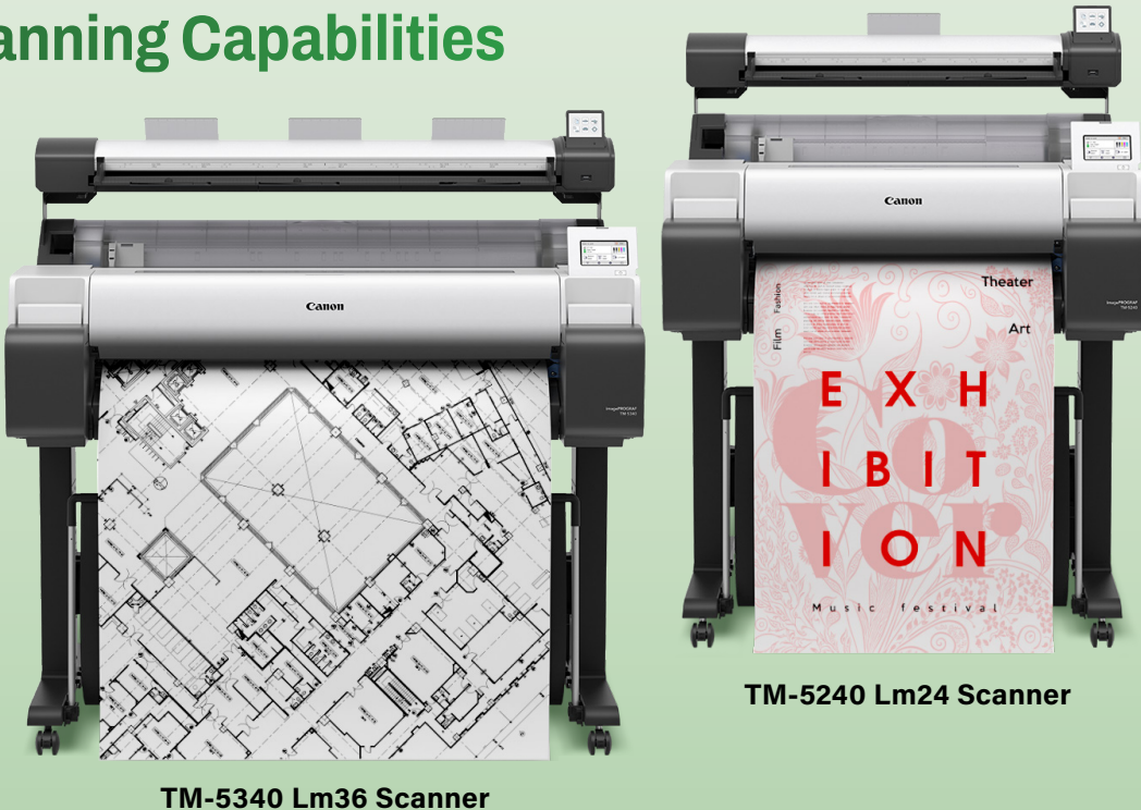
TM-5340 Lm36 Scanner

The TM-5240 and TM-5340 can be utilised alongside a scanner with enhanced capabilities that improve scanning productivity and operability by offering a maximum paper thickness of 0.8mm as well as featuring new transparent guides .